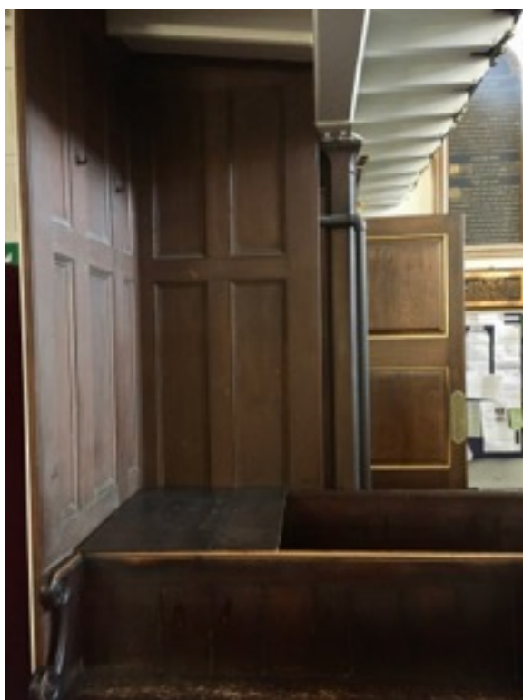
South lobby looking to the west